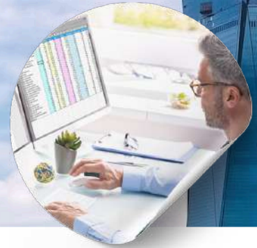
Chief Executive Officers (CEOs), human resources, finance, procurement etc