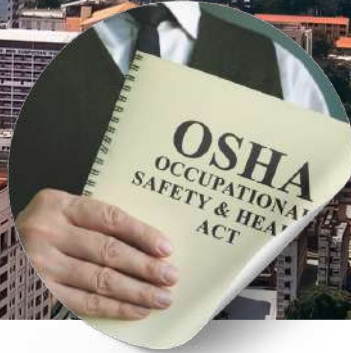
International and regional OSH NGOs and Tourism organizations