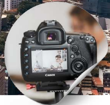
Media practitioners – digital, electronic and printed.