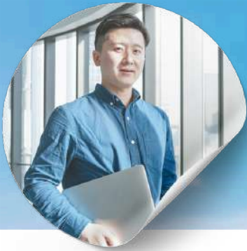
Investors & Business Owners (employers)