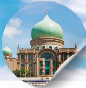
High-level government officials, decision-makers in the public and private sectors