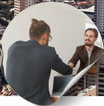
Government and Public OSH organizations