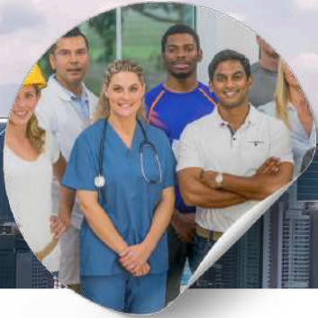
OSH Practitioners and Professionals