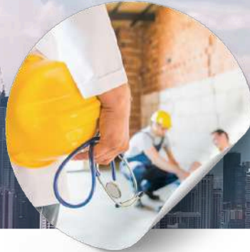
Occupational medicine, inspectors, trainers, auditors etc