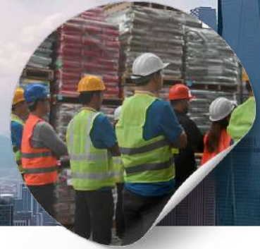
Trade unions, workers and their representatives